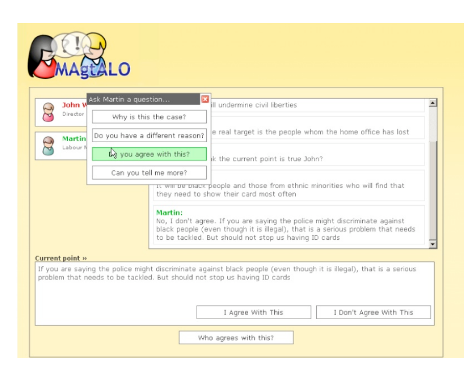
Fig. 3. Dialogical interaction in MAgtALO